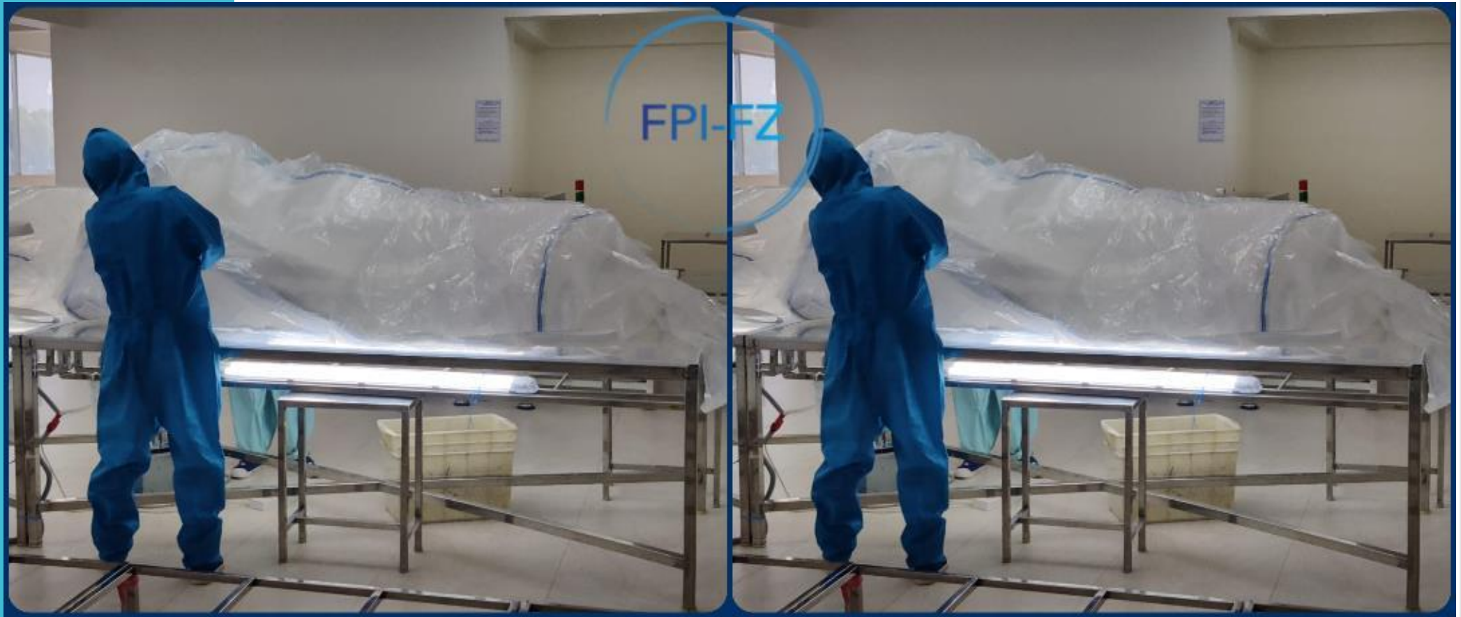
Pre-Shipment inspection on the light table