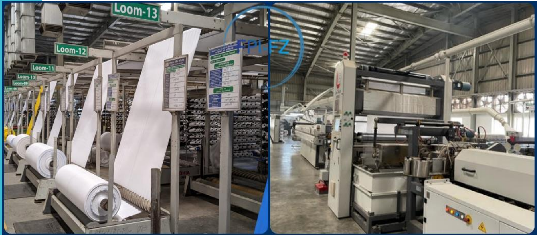
Circular weaving looms and Tape extrusion plant