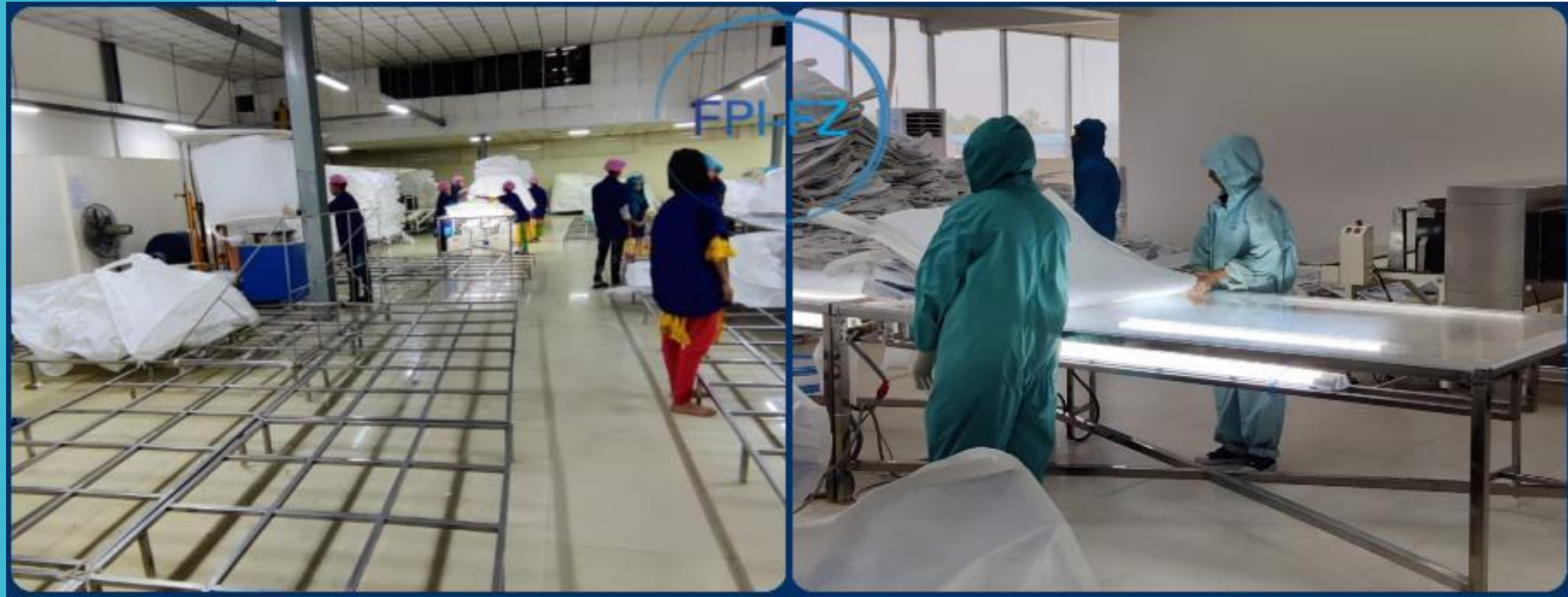
Sewing floor and Light table for QC check