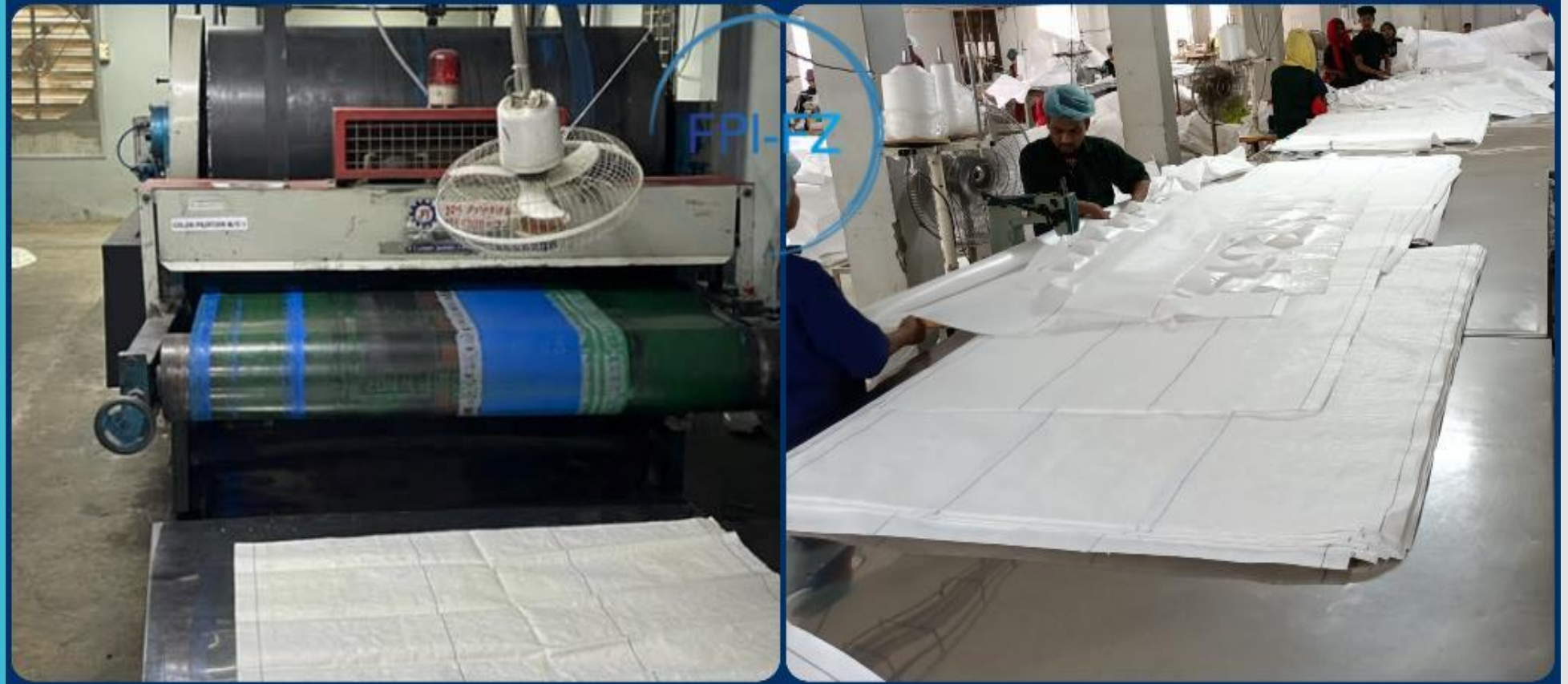
Bag Printing section(upto 4 colors) and in second picture bag sewing section.